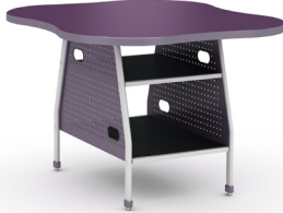
MAKER™ INVENT™ TABLE WITH GLIDES

Paragon MAKER® INVENT™ Tables are ideal for your next STEM, STEAM or Maker lab. MAKER® INVENT™ Tables can be mobile and moved with the lesson or stationary and remain in preferred set-up. The work surface can be configured using laminate, butcher block, chemical resistant, phenolic and chemical resistant phenolic materials. The table has a reinforced base structure to accommodate the needs of Making. The sides of the base are equipped with small eyelet 1/4 inch holes that allow for tools and writing utensils to be stored using optional 1/4 inch peghooks. Two storage shelves are also located within the base and are accessible from either side of the table. Pair MAKER® INVENT™ tables with Paragon MAKER® IDEA Boards for a comprehensive active learning environment.