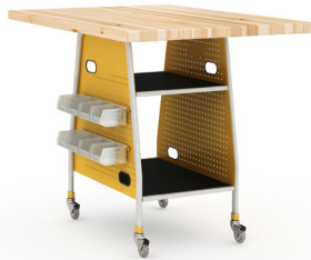
MAKER™ INVENT™ TABLE WITH CASTERS