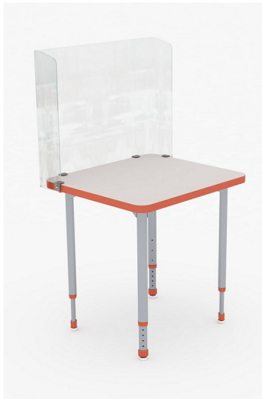
Rear Flexible Divider