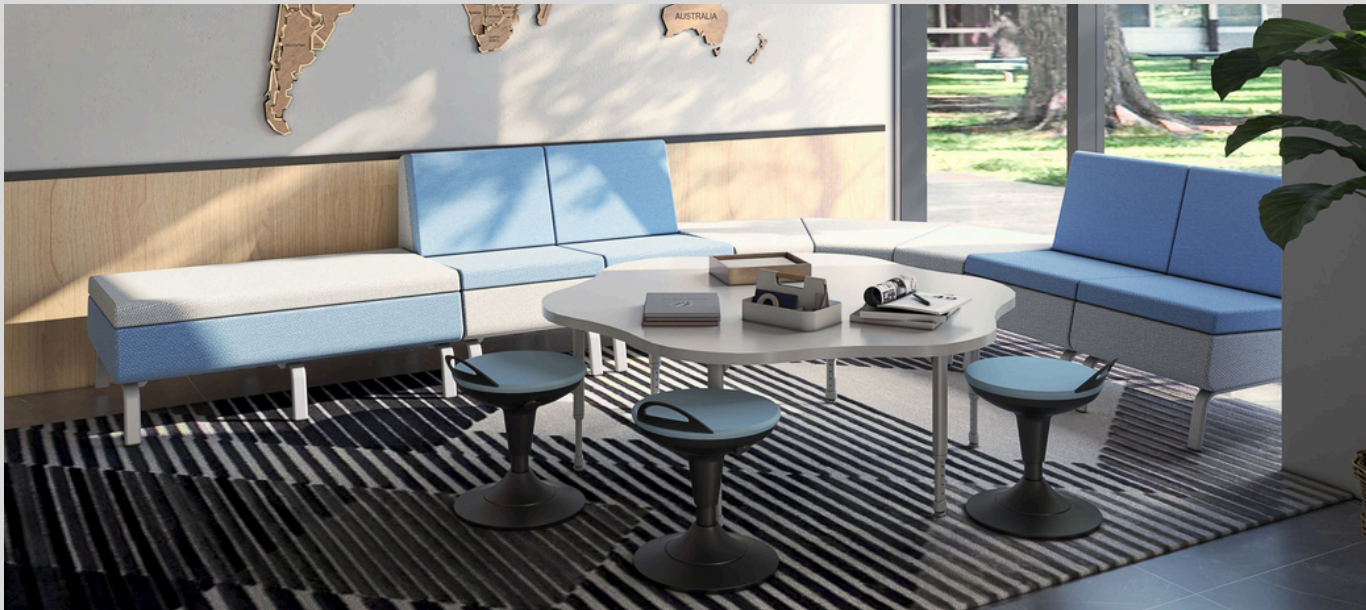
Zones for Focus