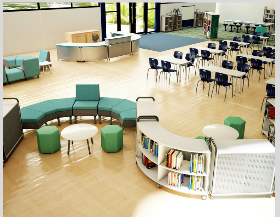
Moments for Movement