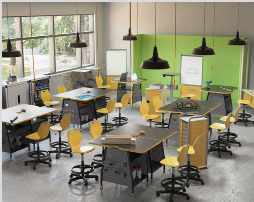
Spaces for Connection